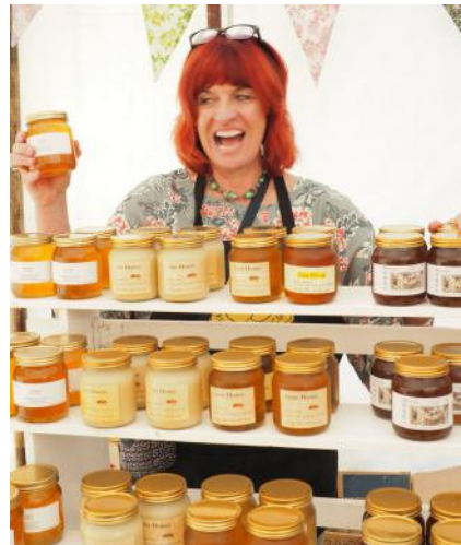
Lots of honey to sell

All photographs on pages 10—12 by Tony Andrews Cover photo by Jean Smye