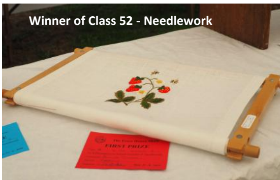
Winner of Class 52 - Needlework