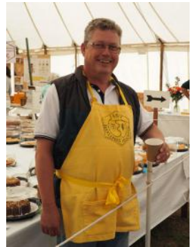
Happy Helpers on the Centenary Stand and the Central Display