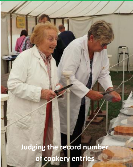
Judging the record number of cookery entries