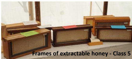
Frames of extractable honey - Class 5