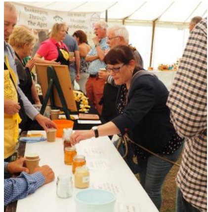
The Honey Tasting Table was very popular