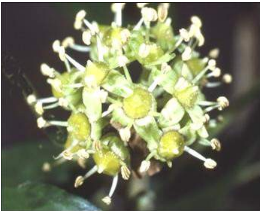
Ivy flowers provide an abundance of late nectar and pollen

The second is the holly blue butterfly which, despite its name, uses ivy as its food plant for its second brood of larvae. (The first brood feed inside holly buds but clearly these are not available later in the year.) The larvae develop inside the buds of the ivy flowers and the pretty little butterflies can often be seen flying around ivy-covered trees. There are some species of moth larvae that also feed on ivy leaves.