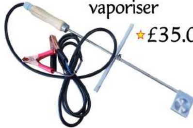
Vapmite New affordable vaporiser ★£35.00★