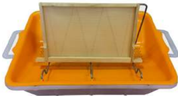
Compact Uncapping Tray ★£35.00★