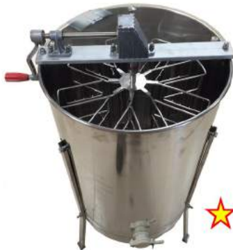
OctiMel Extractor ★£295★ 8 frame Stainless Steel Radial Extractor

Don't miss our ★Black Friday Sale★ starts Friday 25th Nov